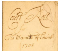
Court Roll for The Mannor of Lowick 1708