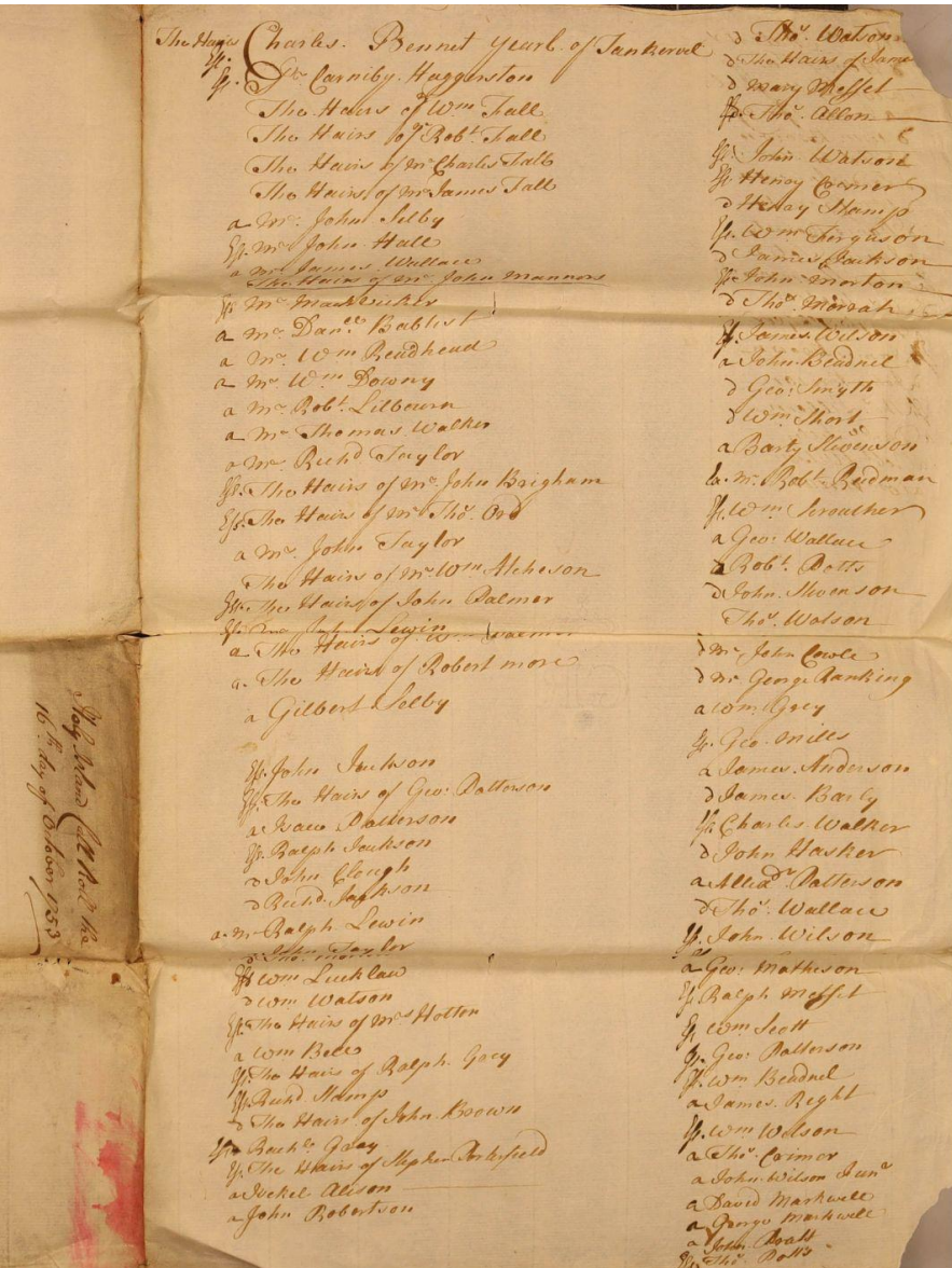
Holy Island Call Roll the 16 th day of October 1753